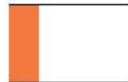
Quarter page (strip)