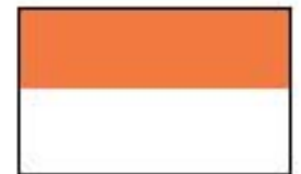
Half page (horizontal)