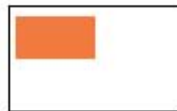
Quarter page (box)